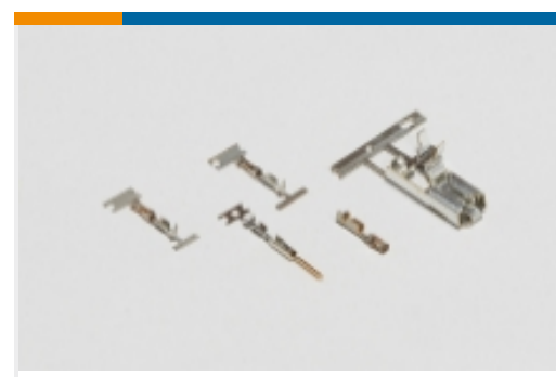
Wire-to-Board Connector Contacts(3)